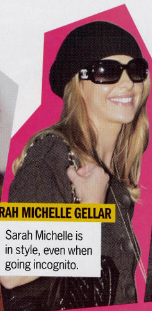
SARAH MICHELLE GELLAR